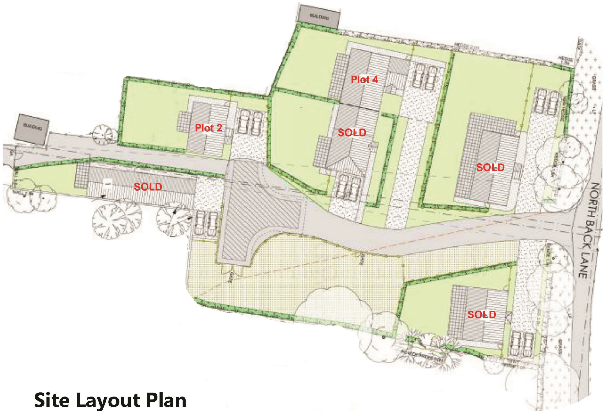
Site Layout Plan